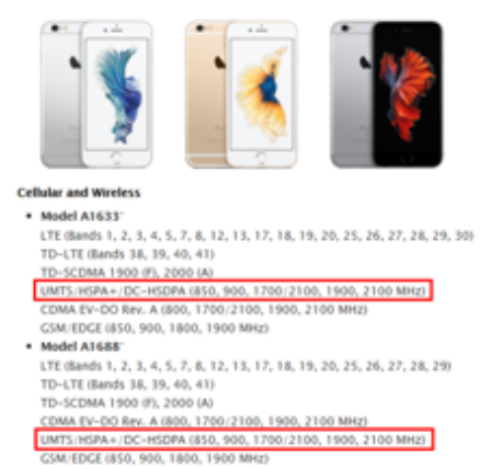
iPhone 6s - Technical Specifications