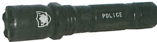
Cutting Edge Products Combined Flashlight and Stun Gun

7. Defendant Cutting Edge Products, Inc. has offered to sell and sold in this Judicial District, and offered to sell and sold in the United States, combined flashlights and stun guns that fall within the scope of the claim of the '249 Patent, all in violation of 35 U.S.C. § 271, et seq. The Cutting Edge Products combined flashlight and stun gun shares with patented design D671,249 a distinctive overall appearance, which includes without limitation a scalloped bezel and distinctive handle.