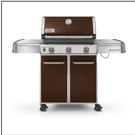
Weber Genesis® S330