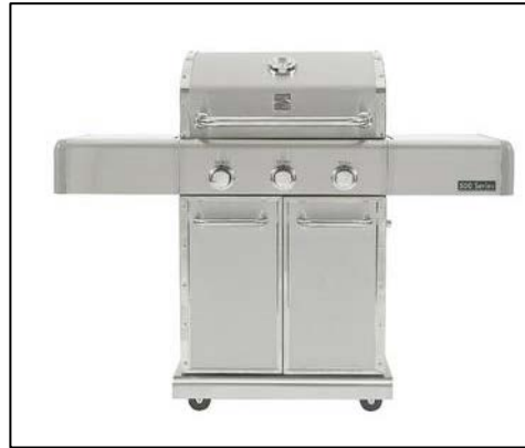
Kenmore Elite Stainless Grill