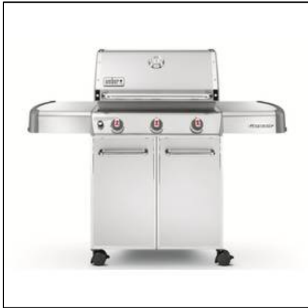
Weber Genesis® S310

58. A side-by-side comparison of the Genesis® grill design and two of the Sears Accused Kenmore Elite 500 Series Gas Grills is shown below: