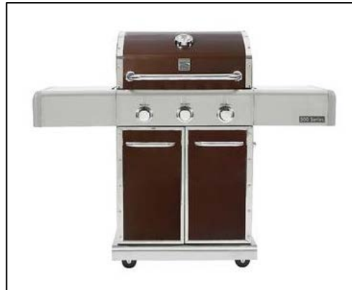
Kenmore Elite Espresso Grill

59. Sears has used in commerce, and continues to use in commerce, the Weber Genesis® grill design to unfairly benefit from Weber's success by selling the Accused Kenmore Elite 500 Series Gas Grills, Accused Kenmore Elite 550 Series Gas Grills, Accused Kenmore Elite 600 Series Gas Grills, and Kenmore Elite 700 Series Gas Grills bearing the same design in this jurisdiction and throughout the United States.