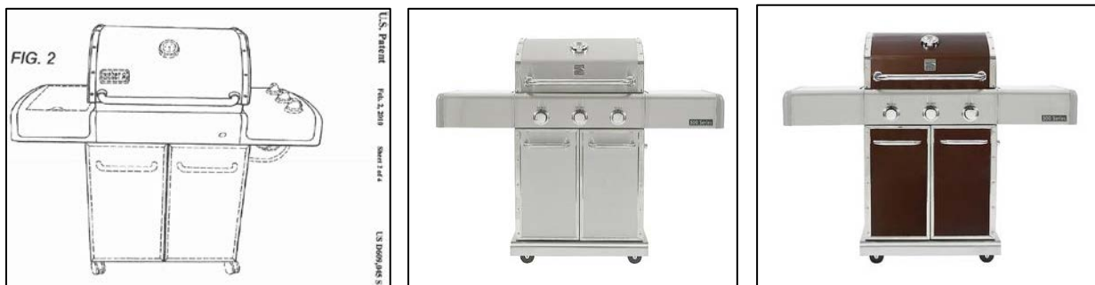
Figure 2 of '045 Patent

47. Figure 2 of the '045 Patent is shown on the far left below, and two Accused Kenmore Elite 500 Series Gas Grills are shown on the right below, as depicted on Sears' www.kenmore.com website. See http://www.kenmore.com/outdoors-grills-smokers-gas-grills/s-1040208?adCell=W2&adCell=W2#viewItems=12&pageNum=1&sortOption=ORIGINAL_SORT_ORDER&&filter=Brand/Kenmore+Elite&lastFilter=Brand , and related URLs.