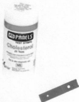
Exhibit E, p. 1 and 2

30. Defendants Infopia Korea, Infopia USA, and Jant have intentionally targeted PTS's distributors and channels of commerce. By presenting copied products, in a copied bottle design, and distributing it via the same distribution channels using the same distributors that PTS uses, Defendants Infopia Korea, Infopia America, and Jant are creating a likelihood of confusion, deception and mistake concerning the source of the products. Defendants Infopia Korea, Infopia America, and Jant are copying an entire line of PTS's business and misappropriating PTS's goodwill.