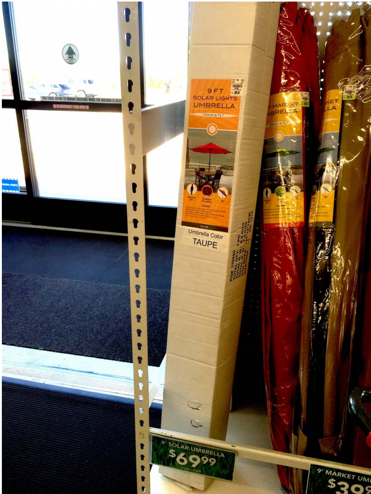
Figure 1 – “9 Ft. Solar Lights Umbrella”