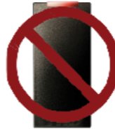
Disable Card Access