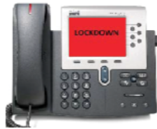
IP Phone Notification