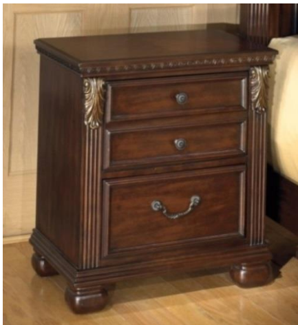
Ashley B526 night stand

25. A visual comparison of Ashley's Leahlyn B526 2-drawer night stand and Defendant's B426 night stand, showing Defendant's slavish copying of the Ashley Works, is shown below.