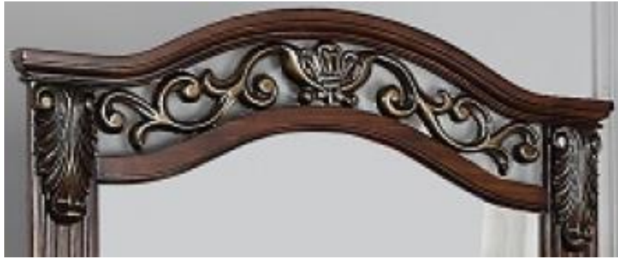
Furniture World B426 mirror

25. A visual comparison of Ashley's Leahlyn B526 2-drawer night stand and Defendant's B426 night stand, showing Defendant's slavish copying of the Ashley Works, is shown below.