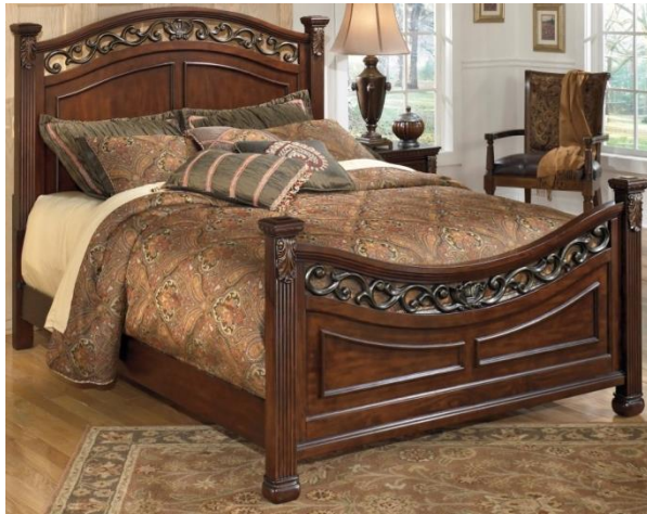
Ashley B526 bedframe

15. A visual comparison of Ashley's Leahlyn B526 bedframe and Defendant's B426 bedframe, showing Defendant's slavish copying of the Ashley Works, is shown below.