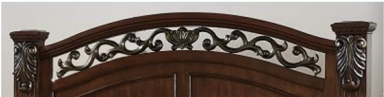
Furniture World B426 headboard