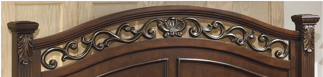
Ashley B526 headboard

17. A visual comparison of the ornamental woodwork and metalwork on Ashley's Leahlyn B526 headboard and Defendant's B426 headboard, showing Defendant's slavish copying of the Ashley Works, is shown below.