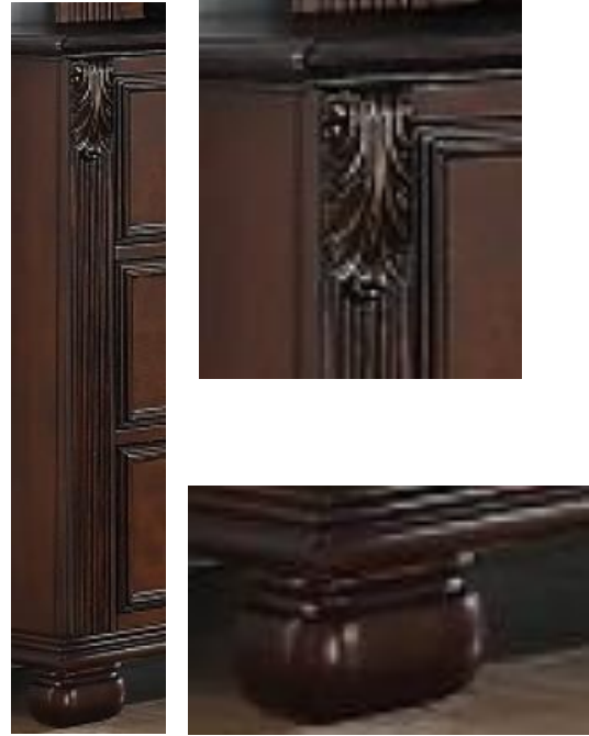
Furniture World B426 dresser

23. A visual comparison of Ashley's Leahlyn B526 mirror and Defendant's B426 mirror, showing Defendant's slavish copying of the Ashley Works, is shown below.