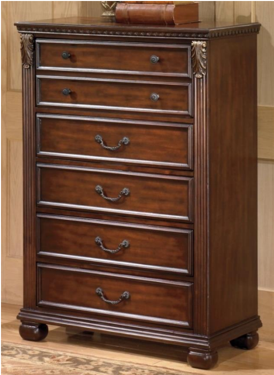
Ashley B526 chest

26. A visual comparison of Ashley's Leahlyn B526 5-drawer chest and Defendant's B426 chest, showing Defendant's slavish copying of the Ashley Works, is shown below.