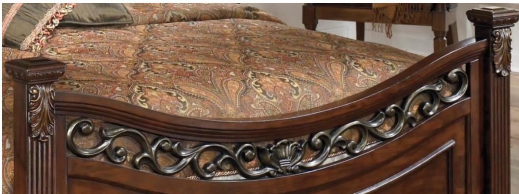
Ashley B526 footboard

19. A visual comparison of the ornamental woodwork and metalwork on Ashley's Leahlyn B526 footboard and Defendant's B426 footboard, showing Defendant's slavish copying of the Ashley Works, is shown below.