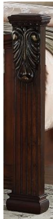
Headboard Post Footboard Post Furniture World B426 bedframe

21. A visual comparison of Ashley's Leahlyn B526 dresser and Defendant's B426 dresser, showing Defendant's slavish copying of the Ashley Works, is shown below.