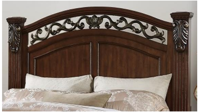
Furniture World B426 headboard

17. A visual comparison of the ornamental woodwork and metalwork on Ashley's Leahlyn B526 headboard and Defendant's B426 headboard, showing Defendant's slavish copying of the Ashley Works, is shown below.