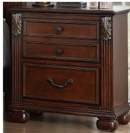
Furniture World B426 night stand