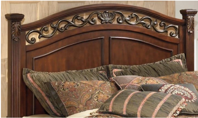
Ashley B526 headboard

16. A visual comparison of the Ashley's Leahlyn B526 headboard and Defendant's B426 headboard, showing Defendant's slavish copying of the Ashley Works, is shown below.