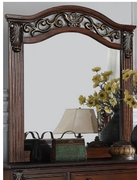
Furniture World B426 mirror