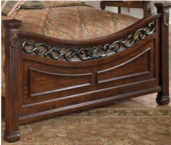
Ashley B526 footboard

18. A visual comparison of the Ashley's Leahlyn B526 footboard and Defendant's B426 footboard, showing Defendant's slavish copying of the Ashley Works, is shown below.