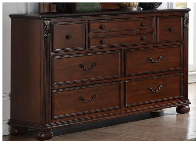
Furniture World B426 dresser