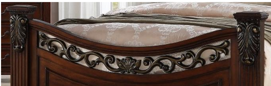
Furniture World B426 footboard