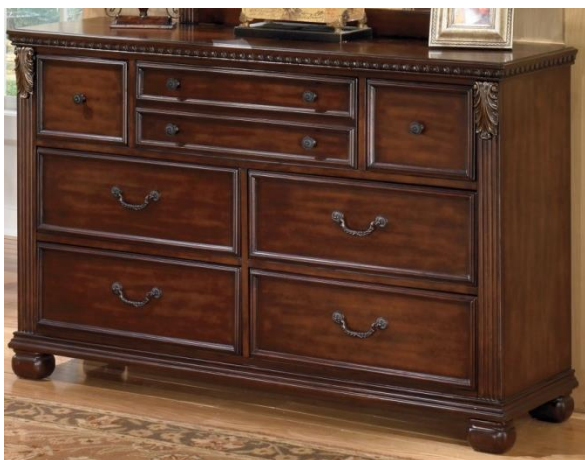
Ashley B526 dresser

21. A visual comparison of Ashley's Leahlyn B526 dresser and Defendant's B426 dresser, showing Defendant's slavish copying of the Ashley Works, is shown below.