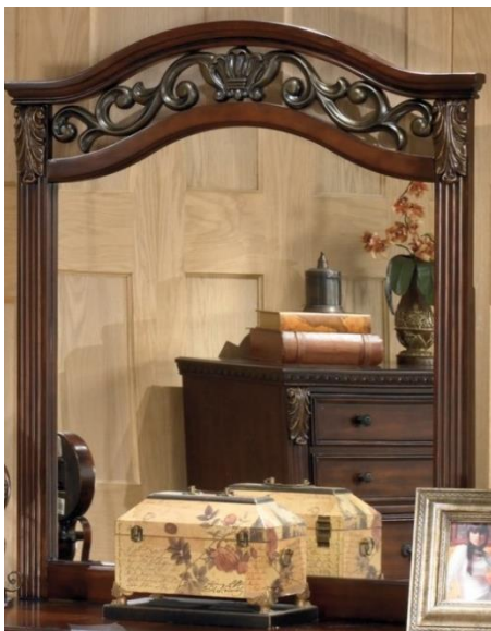
Ashley B526 mirror

23. A visual comparison of Ashley's Leahlyn B526 mirror and Defendant's B426 mirror, showing Defendant's slavish copying of the Ashley Works, is shown below.