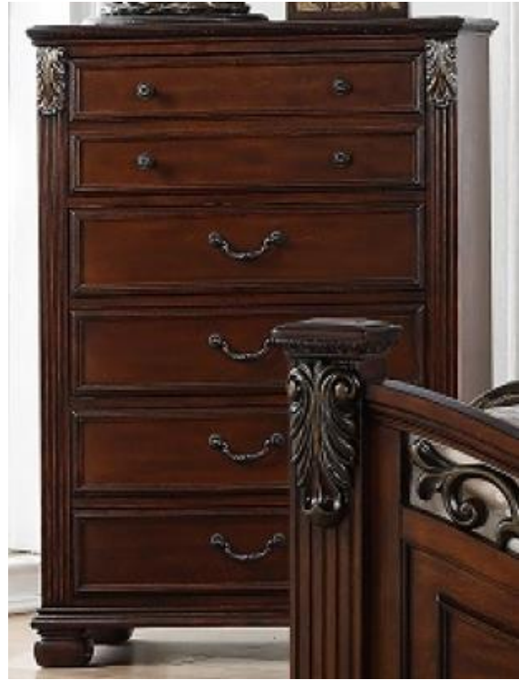
Furniture World B426 chest

27. Defendant had access to, and was aware of, the Ashley Works when it adopted the design for, manufactured and/or had manufactured, sold and offered for sale the B426 furniture.