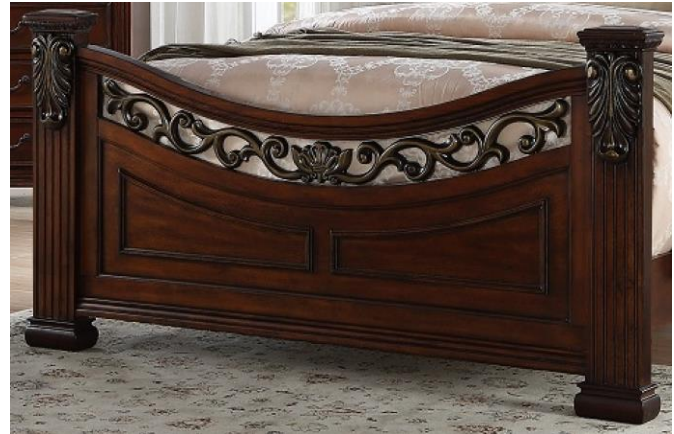
Furniture World B426 footboard

19. A visual comparison of the ornamental woodwork and metalwork on Ashley's Leahlyn B526 footboard and Defendant's B426 footboard, showing Defendant's slavish copying of the Ashley Works, is shown below.