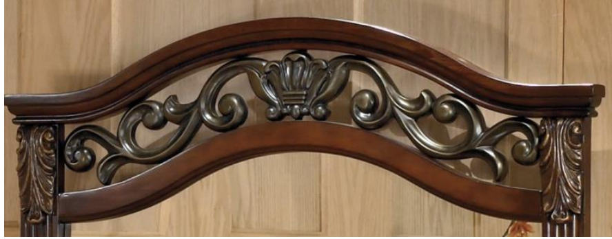
Ashley B526 mirror

24. A visual comparison of the ornamental woodwork and metalwork on Ashley's Leahlyn B526 mirror and Defendant's B426 mirror, showing Defendant's slavish copying of the Ashley Works, is shown below.