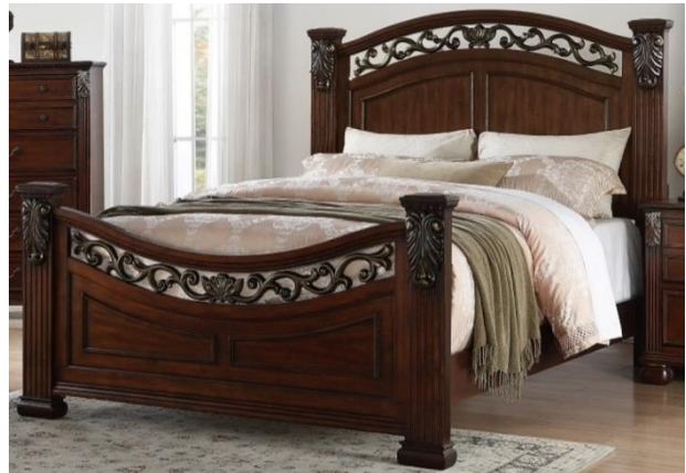
Furniture World B426 bedframe