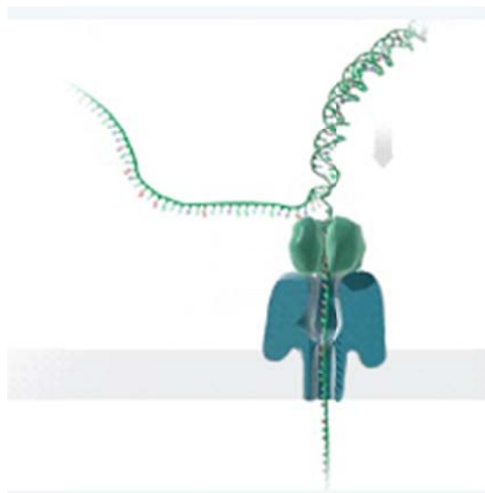
Exhibit 7. As the DNA passes through the hole, it disrupts the electrical current that is passing through the hole, thus producing a signal. To evaluate the sequence, one can attempt to correlate this signal with the DNA bases that are passing through the hole.

15. To sequence DNA using Oxford's products, one first applies a voltage across the membrane such that an electrical current flows through the hole. A strand of DNA is then drawn through the hole: