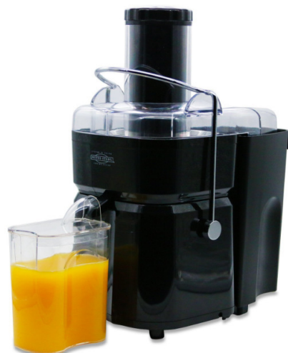
Nutri-Stahl Juicer Machine

21. Modern juicers work much differently as well. Unlike other juicers, the Juicero accepts pouches of fresh produce that are pressed inside the machine to extract nutrient-rich juice. There are no blades, grinders, spigots, or other parts that require disassembly or cleaning after each use. Due to the unique design of the Juicero Press, which utilizes produce-filled packs, neither the produce or juice ever comes in contact with the device.