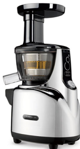
Kuvings NS-950 Silent