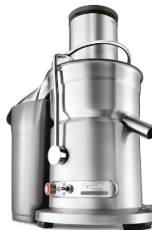
Breville 800 JEXL