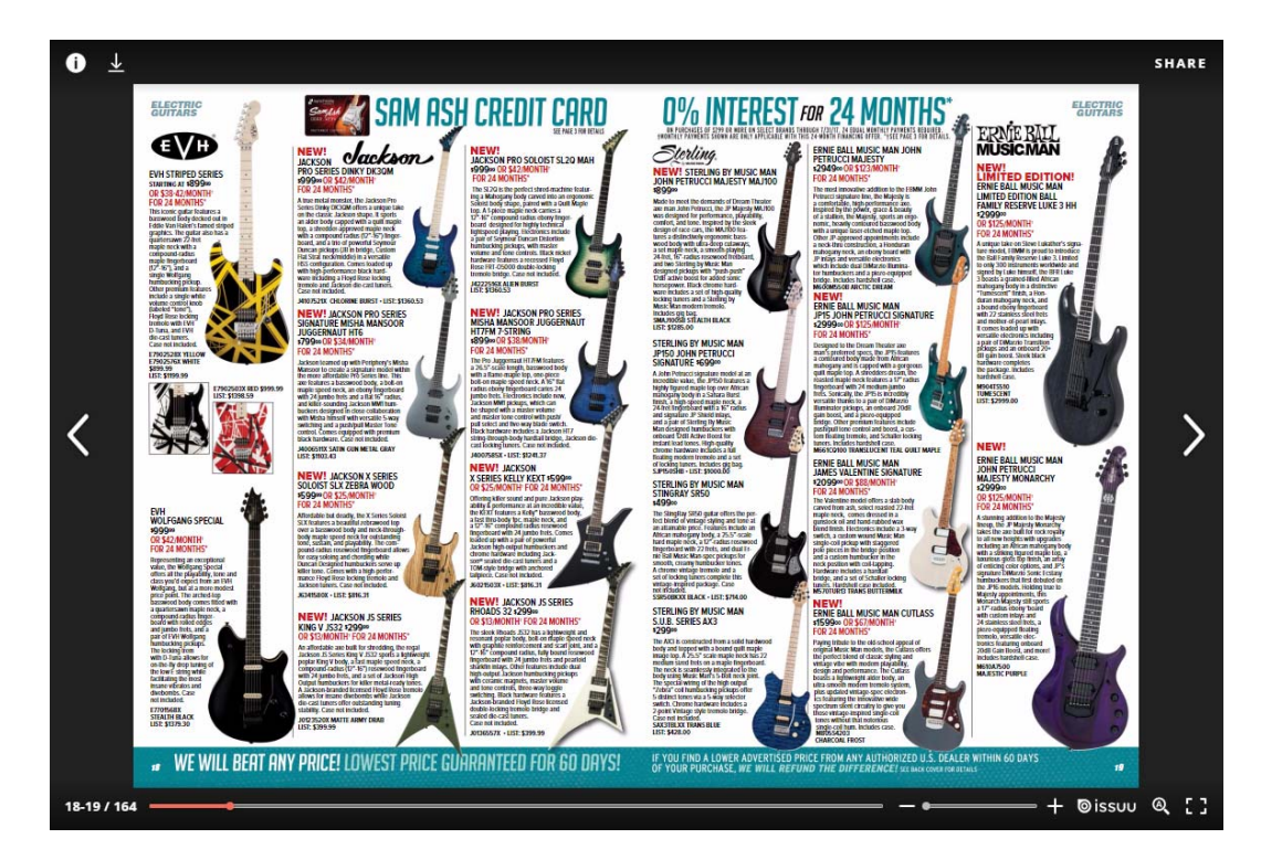
Online Ad. The electronic catalog includes a first selectable portion corresponding with duplication of the appearance of a first product of the at least two different products and selection