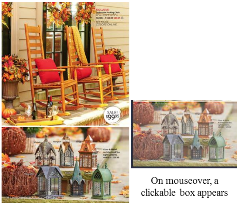
On mouseover, a clickable box appears

chair/334144?cm_mmc=jomag-_-catalog-_-2017-_-17&code-macs=JMGFLUBK17&SourceCode=JMGFLUBK17&utm_source=jmag&utm_medium=online cat&utm_campaign=JMGFLUBK17. The electronic catalog includes a second selectable portion corresponding with duplication of the appearance of a second product of the at least two different products and selection of the second selectable portion provides additional information about the second product and enables a user to initiate an online purchase of the second product.