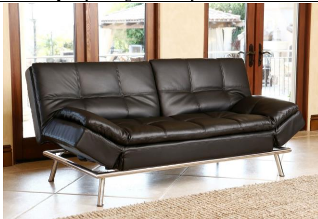
Illustration 4: Exemplary Image of Abbyson's "Chelsea" Infringing Product

15. Illustration 4 below shows an example of Abbyson's Infringing Products.