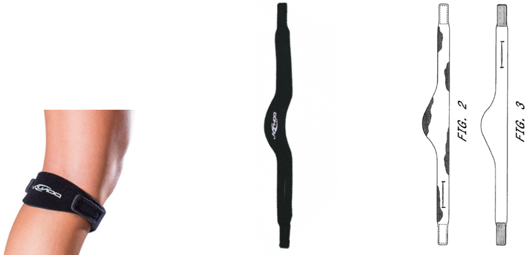
DonJoy Cross Strap

21. The Accused Products incorporate other specific features of the '806 Patent, including opposing end fastener tabs, wider straps with a slit adjacent to only one end, and a protruding, wider and roughly centered middle portion: