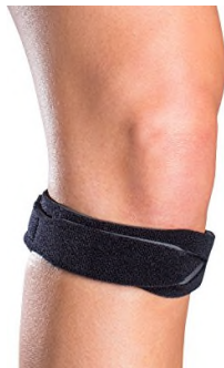
DonJoy Cross Strap

20. The Accused Products are identical and/or so substantially similar to the design of the ‘806 Patent as to deceive an ordinary observer. They have the same and/or highly similar shape and dimensions, and the unique “strap-through” feature of the ‘806 Patent’s design: