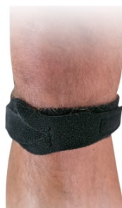
DonJoy Patella X Strap