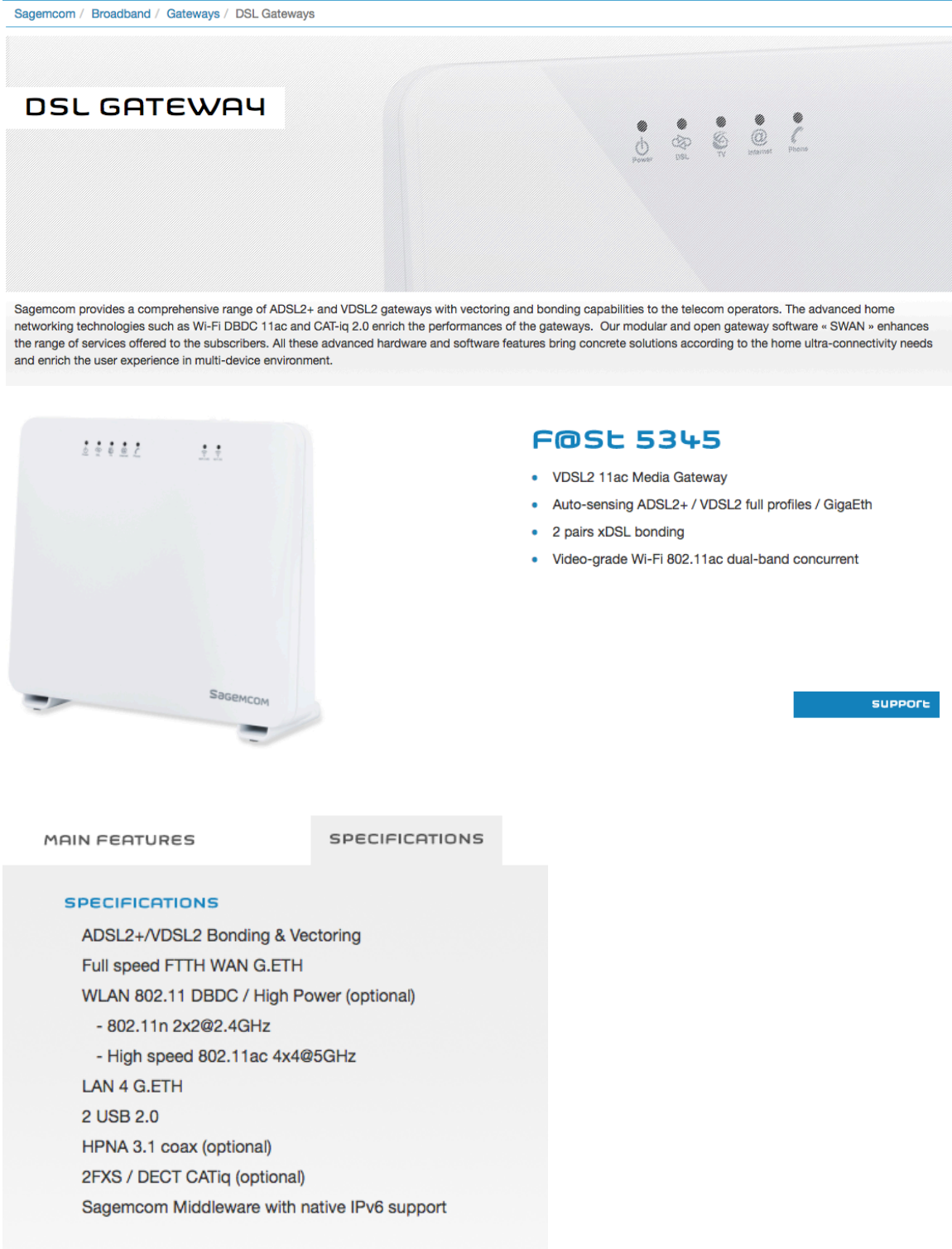
Figure 1. The F@St 5345 is compliant with IEEE 802.11ac and 802.11n wireless distribution systems, and therefore provides a customer premises system.

18. The F@ST 5345 uses “digital data packets” in that it uses a container of data