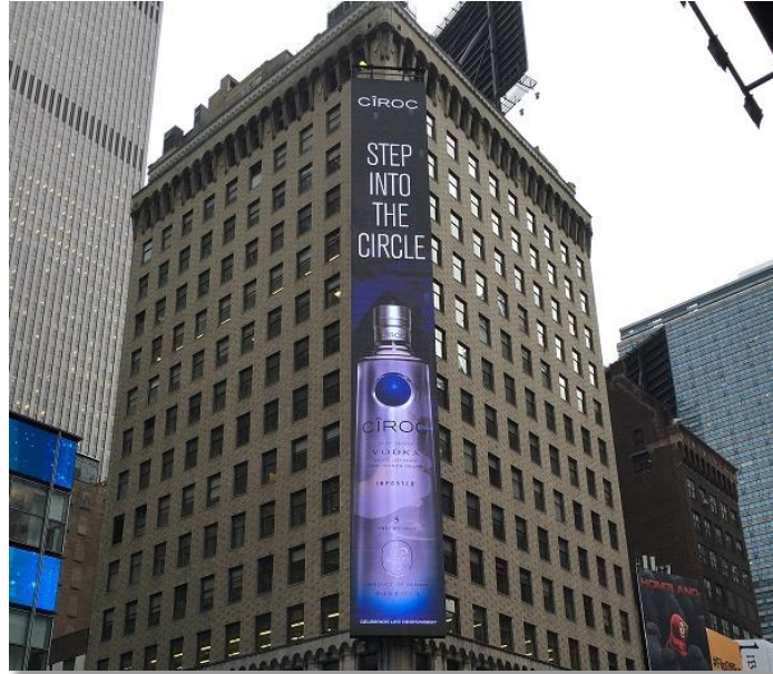
(Figure 2 – Ultravision’s UltraPanel configured as digital billboard in Times Square)

9. Further, Ultravision designed, engineered, manufactured, and installed an installation on Cromwell Road in London, which is the largest digital display in Europe. The Cromwell Road installation is shown below: