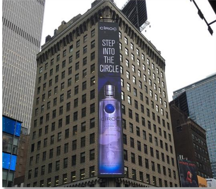
(Figure 2 – Ultravision’s UltraPanel configured as digital billboard in Times Square)

9. Further, Ultravision designed, engineered, manufactured, and installed an installation on Cromwell Road in London, which is the largest digital display in Europe. The Cromwell Road installation is shown below: