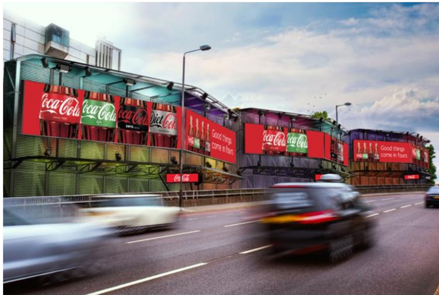
(Figure 3 – Ultravision’s UltraPanel forming the largest digital display in Europe)

9. Further, Ultravision designed, engineered, manufactured, and installed an installation on Cromwell Road in London, which is the largest digital display in Europe. The Cromwell Road installation is shown below: