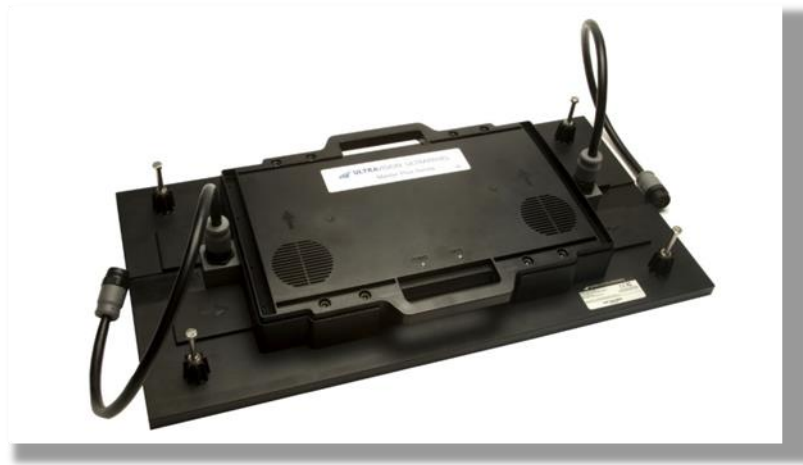
(Figure 1 – Ultravision's UltraPanel)

revolutionized the industry by developing and introducing the UltraPanel product: a lightweight modular, waterproof LED display panel in standard sizes that can easily be built into large displays of different sizes and shapes, requires no waterproof outer cabinet, and runs on single-phase electric power. This lightweight, single-phase power, modular LED display panel dramatically lowered the customer's total cost of installation and total cost of operation compared to older traditional cabinet LED display designs. A picture of one of Ultravision's UltraPanel products is shown below: