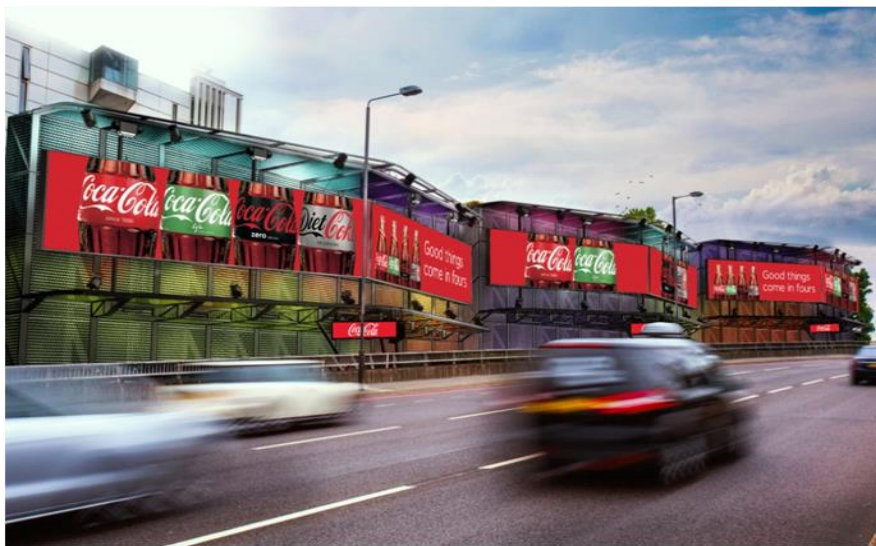
(Figure 3 – Ultravision's UltraPanel forming the largest digital display in Europe)

9. Further, Ultravision designed, engineered, manufactured, and installed an installation on Cromwell Road in London, which is the largest digital display in Europe. The Cromwell Road installation is shown below: