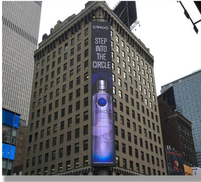
(Figure 2 – Ultravision's UltraPanel configured as digital billboard in Times Square)

installed a majority of the LED displays in Times Square. One of Ultravision's installations in Times Square is shown below: