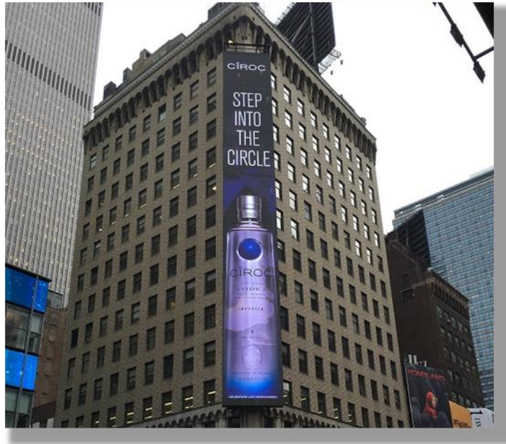
(Figure 2 – Ultravision's UltraPanel configured as digital billboard in Times Square)

installed a majority of the LED displays in Times Square. One of Ultravision's installations in Times Square is shown below: