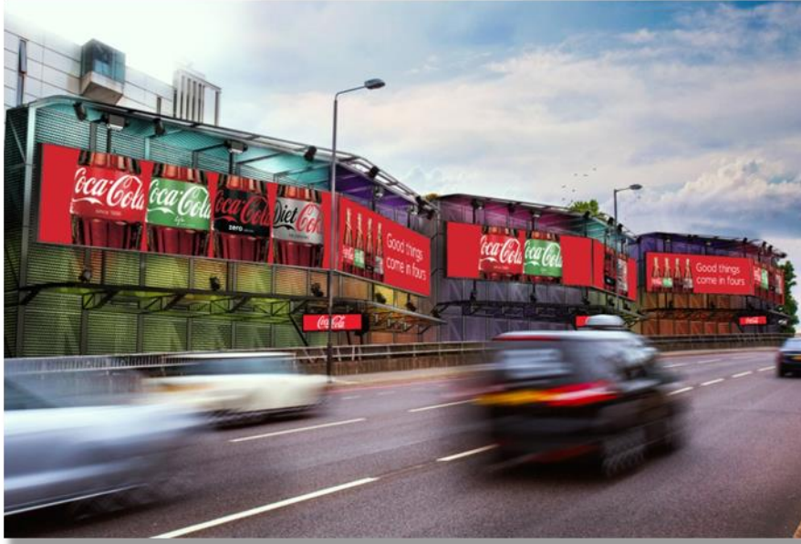
(Figure 3 – Ultravision’s UltraPanel forming the largest digital display in Europe)

10. Upon its introduction, the UltraPanel immediately made prior cabinet-based designs obsolete. The UltraPanel’s unique combination of features has led to nearly the entire LED display industry, including but not limited to Defendants, copying this modular, waterproof design.