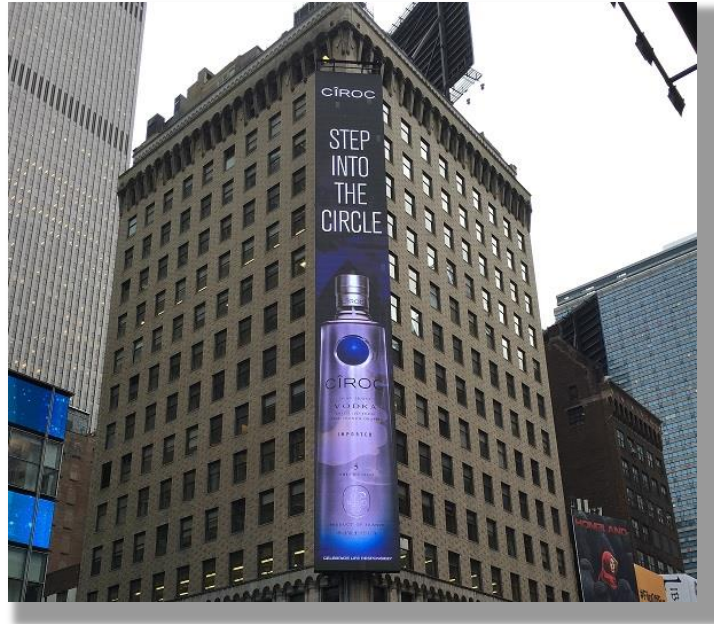
(Figure 2 – Ultravision's UltraPanel configured as digital billboard in Times Square)

installed a majority of the LED displays in Times Square. One of Ultravision's installations in Times Square is shown below: