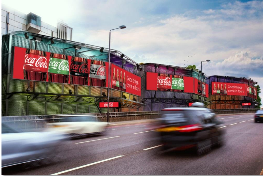
(Figure 3 – Ultravision’s UltraPanel forming the largest digital display in Europe)

10. Upon its introduction, the UltraPanel immediately made prior cabinet-based designs obsolete. The UltraPanel’s unique combination of features has led to nearly the entire LED display industry, including but not limited to Defendants, copying this modular, waterproof design.