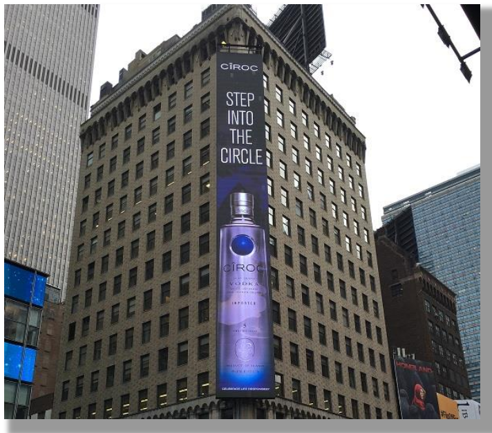
(Figure 2 – Ultravision's UltraPanel configured as digital billboard in Times Square)

installed a majority of the LED displays in Times Square. One of Ultravision's installations in Times Square is shown below: