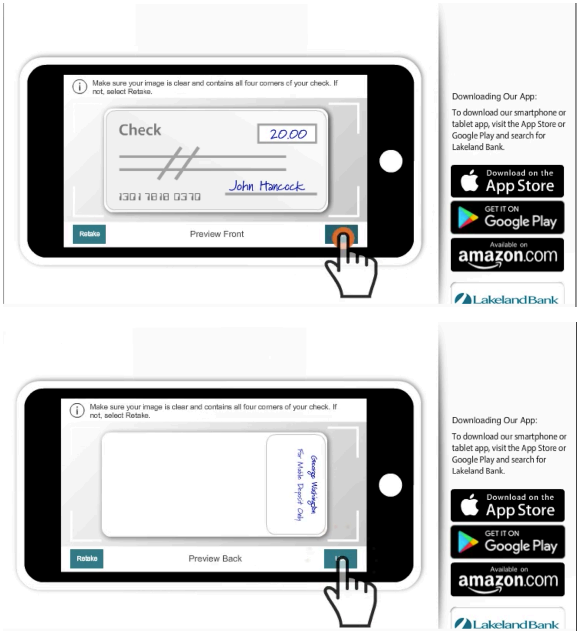
Figure 2. Lakeland's Mobile App scans and reads the check image in order to take a picture of the check.

17. Automatically uploading and displaying on the device's display screen an image transfer menu obtained via a communication channel from Lakeland's computer(s), where that menu offers the option to deposit the scanned check. See Figure 3; http://www.onlinebanktours.com/mobile/?b=427&c=27179 .