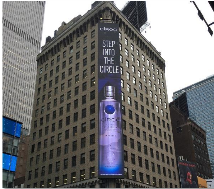
(Figure 2 – Ultravision’s UltraPanel configured as digital billboard in Times Square)

9. Further, Ultravision designed, engineered, manufactured, and installed an installation on Cromwell Road in London, which is the largest digital display in Europe. The Cromwell Road installation is shown below: