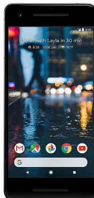
Google Pixel 2