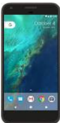
Google Pixel XL