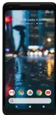
Google Pixel 2 XL

123. The foregoing devices are collectively referred to as the “’978 Accused Products” and include the following specifications and features.