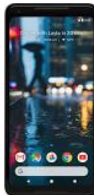
Google Pixel 2 XL

The foregoing devices are collectively referred to as the “’438 Accused Products” and include the below specifications and features.