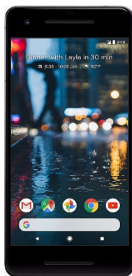
Google Pixel 2