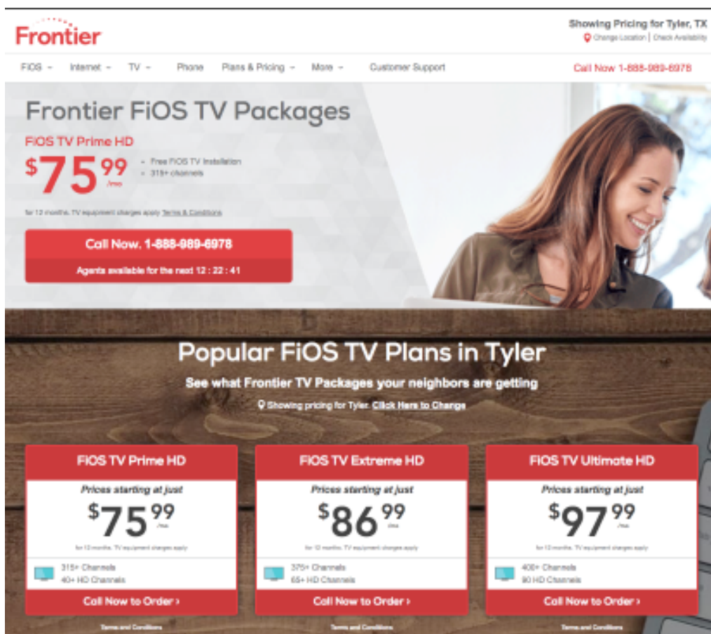
Figure 2 – Screen shot of Defendant offering of “Frontier FiOS TV” from product offerings for Zip Code 75702 of Tyler, Smith County, Texas, as viewed at https://go.frontier.com/fios/tv .

and services) (“FiOS TV Accused Products and Services,” and collectively with the Business Internet Accused Products and Services, “Accused Products and Services”).