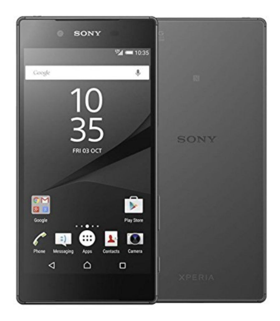
Figure 1. Sony's Xperia Z5 includes special characters, such as accented letters, that are selected from a primary key.

15. Sony's Xperia Z5 has claim element 1(a): "at least one cluster key." For example, Sony's Xperia Z5 has a touchscreen keyboard with a button before and after it is selected. See Figure 2, available at: <a href="https://support.sonymobile.com/global-en/xperiaz5/userguide/swift-key-overview/#gref">https://support.sonymobile.com/global-en/xperiaz5/userguide/swift-key-overview/#gref</a>.