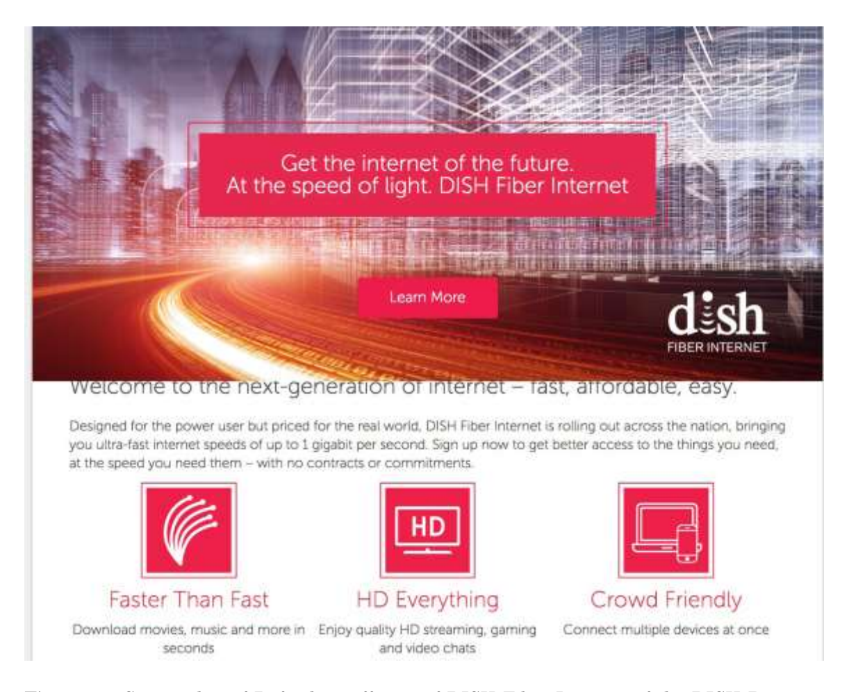
Figure 1 – Screen shot of Defendant offering of DISH Fiber Internet of the DISH Business webpage, as viewed at <a href="https://www.dish.com/business/fiber/">https://www.dish.com/business/fiber/</a>.

20. Defendant's DISH Fiber Internet Accused Products and Services use methods, devices, and systems taught by Blue Spike's six (6) asserted patents below: