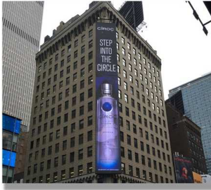
(Figure 2 – Ultravision’s UltraPanel configured as digital billboard in Times Square)

8. Further, Ultravision designed, engineered, manufactured, and installed an installation on Cromwell Road in London, which is the largest digital display in Europe. The Cromwell Road installation is shown below: