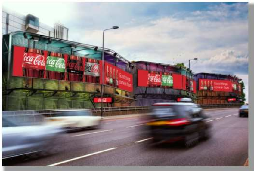
(Figure 3 – Ultravision’s UltraPanel forming the largest digital display in Europe)

8. Further, Ultravision designed, engineered, manufactured, and installed an installation on Cromwell Road in London, which is the largest digital display in Europe. The Cromwell Road installation is shown below: