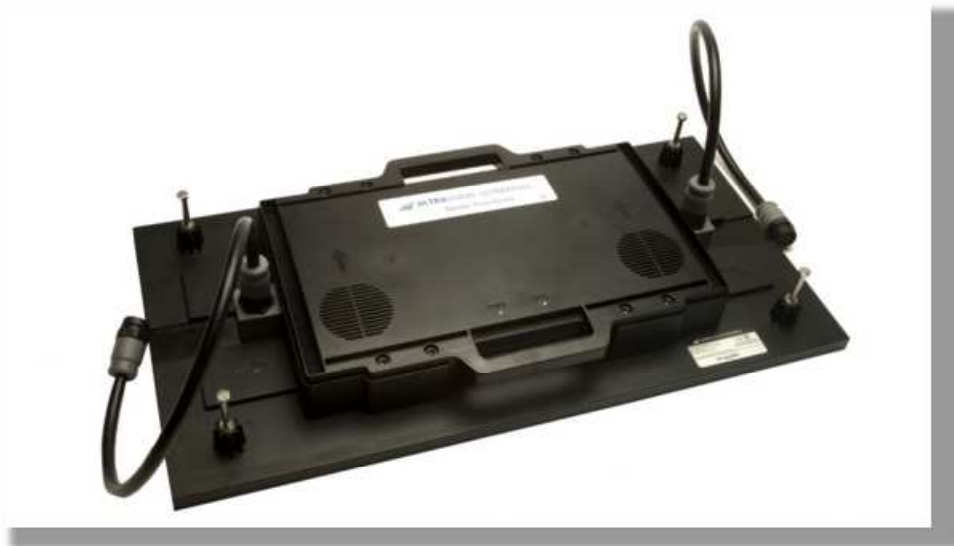
(Figure 1 – Ultravision’s UltraPanel)

7. Each UltraPanel is approximately 1 foot by 2 foot, and can include anywhere from 512 pixels to as many as 12,800 pixels. The panels are specifically designed and configured to be assembled into larger LED signs and billboards. Ultravision’s UltraPanel displays can be configured and assembled as a small billboard or sign, a sports team’s scoreboard or digital display, or even a large scale “Spectacular,” such as what is commonly seen in New York City’s Times Square. Ultravision designed, developed, engineered, assembled, and installed a majority of the LED displays in Times Square. One of Ultravision’s installations in Times Square is shown below: