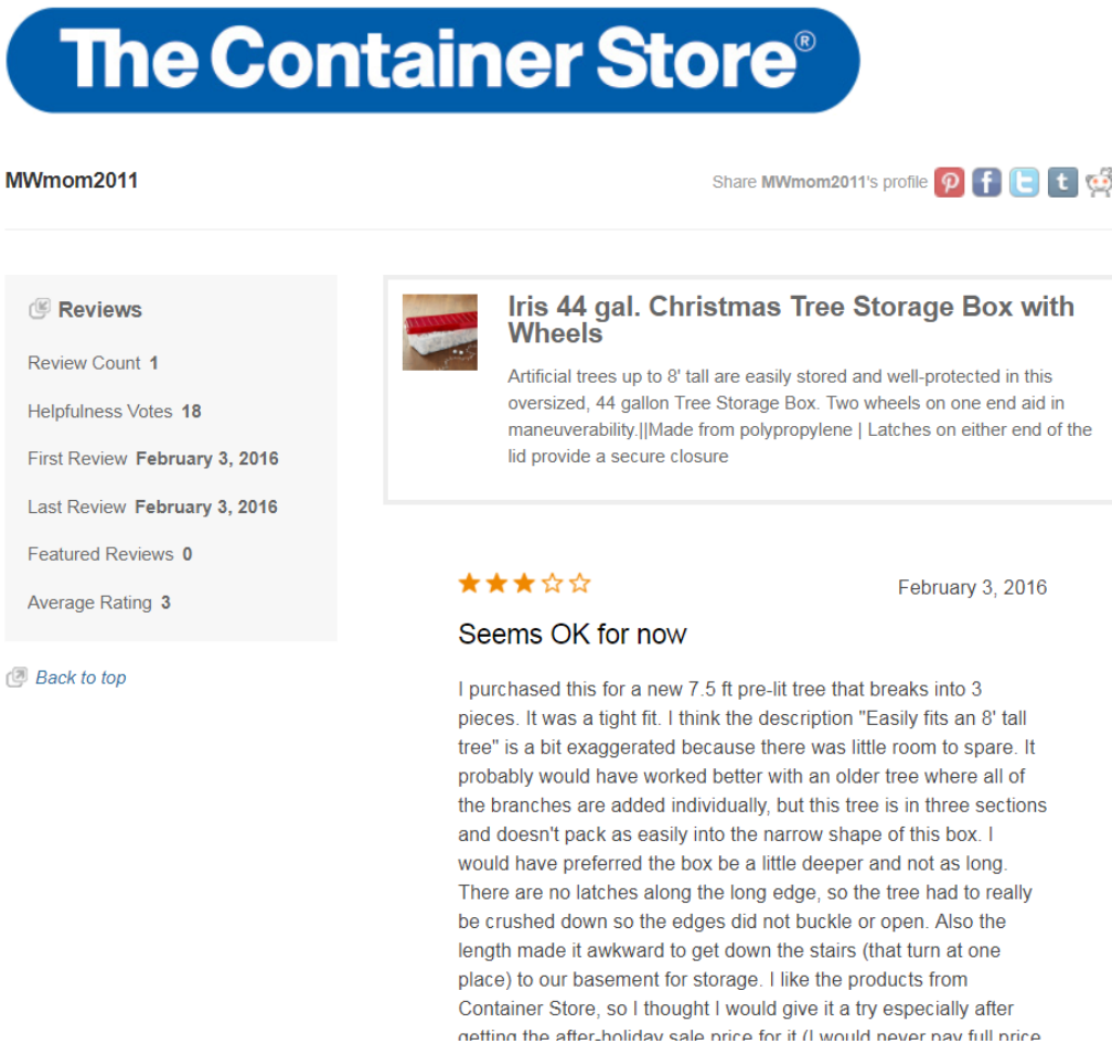
(Figure 3 - Container Website displaying all messages by a particular author.)

55. On information and belief, at least one version of the Accused Container Infrastructures processes a user command associated with one or more of said electronic message items taken from said set of electronic message items, which user command is used to locate an author of said message items and/or additional message items originating from said author. For example, a user may select to receive all reviews by the first message author as shown in Figure 3.