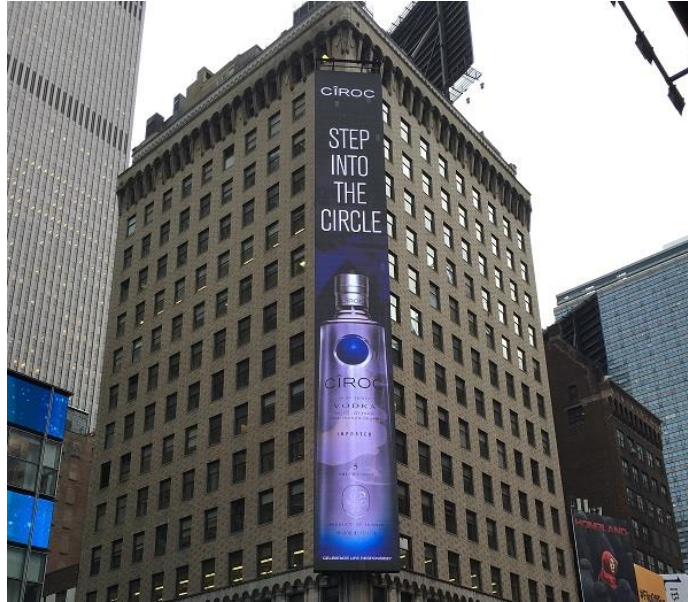
(Figure 2 – Ultravision’s UltraPanel configured as digital billboard in Times Square)

8. Further, Ultravision designed, engineered, manufactured, and installed an installation on Cromwell Road in London, which is the largest digital display in Europe. The Cromwell Road installation is shown below: