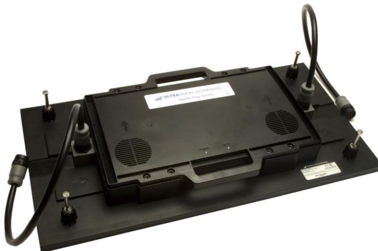
(Figure 1 – Ultravision’s UltraPanel)

7. Each UltraPanel is approximately 1 foot by 2 foot, and can include anywhere from 512 pixels to as many as 12,800 pixels. The panels are specifically designed and configured to be assembled into larger LED signs and billboards. Ultravision’s UltraPanel displays can be configured and assembled as a small billboard or sign, a sports team’s scoreboard or digital display, or even a large scale “Spectacular,” such as what is commonly seen in New York City’s Times Square. Ultravision designed, developed, engineered, assembled, and installed a majority of the LED displays in Times Square. One of Ultravision’s installations in Times Square is shown below: