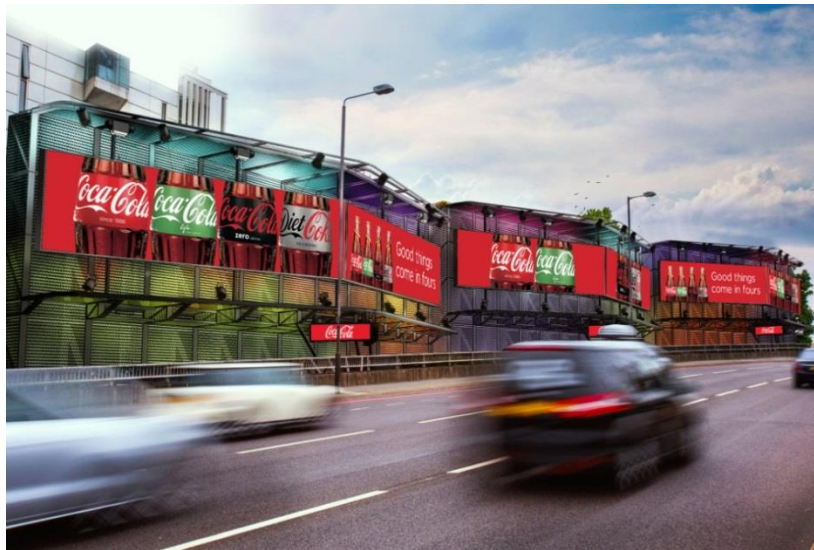
(Figure 3 – Ultravision’s UltraPanel forming the largest digital display in Europe)

8. Further, Ultravision designed, engineered, manufactured, and installed an installation on Cromwell Road in London, which is the largest digital display in Europe. The Cromwell Road installation is shown below: