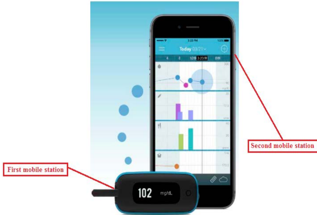
Figure 2. AgaMatrix's app works on a mobile device.

19. AgaMatrix's app satisfies claim element 7(a): "a first mobile station." For example, AgaMatrix's app works on a mobile device. See Figure 2.