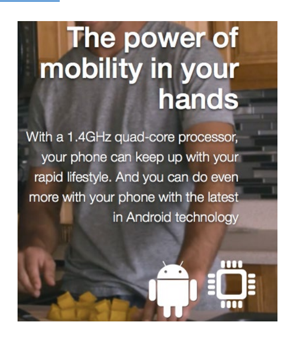
Figure 4. T-Mobile's Defiant has a 1.4GHz quad-core processor.

19. T-Mobile provides a device with a microprocessor configured to facilitate operation of and communications by the electronic wireless hand held multimedia device. For example, T-Mobile's Defiant has a 1.4GHz quad-core processor. See Figure 4; https://coolpad.us/products/defiant/.