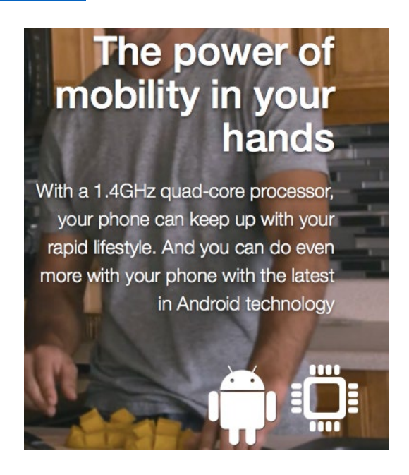
Figure 8. T-Mobile's Defiant has a 1.4GHz quad-core processor.

27. T-Mobile provides a device with a microprocessor configured to facilitate operation of and communications by the electronic wireless hand held multimedia device. For example, T-Mobile's Defiant has a 1.4GHz quad-core processor. See Figure 8; https://coolpad.us/products/defiant/.