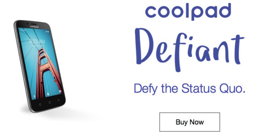
Figure 1. T-Mobile's Defiant is an electronic wireless hand held multimedia device.

17. T-Mobile provides a device with at least one of a wireless unit and a tuner unit supporting bi-directional data communications of data including video and text for the electronic wireless hand held multimedia device with remote data resources over cellular telecommunications networks, over wireless local area networks and over a direct wireless connection with electronic devices located within short range using Bluetooth communications after accepting a passcode from a user of the multimedia device during the communications. For example, T-Mobile's Defiant supports data communication over network LTE, WiFi, and Bluetooth. See Figure 2; https://coolpad.us/products/defiant/specs/.