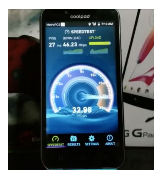
Figure 7. T-Mobile's Defiant has a touch sensitive display screen allowing users to select data on the touch screen.

27. T-Mobile provides a device with a microprocessor configured to facilitate operation of and communications by the electronic wireless hand held multimedia device. For example, T-Mobile's Defiant has a 1.4GHz quad-core processor. See Figure 8; https://coolpad.us/products/defiant/.