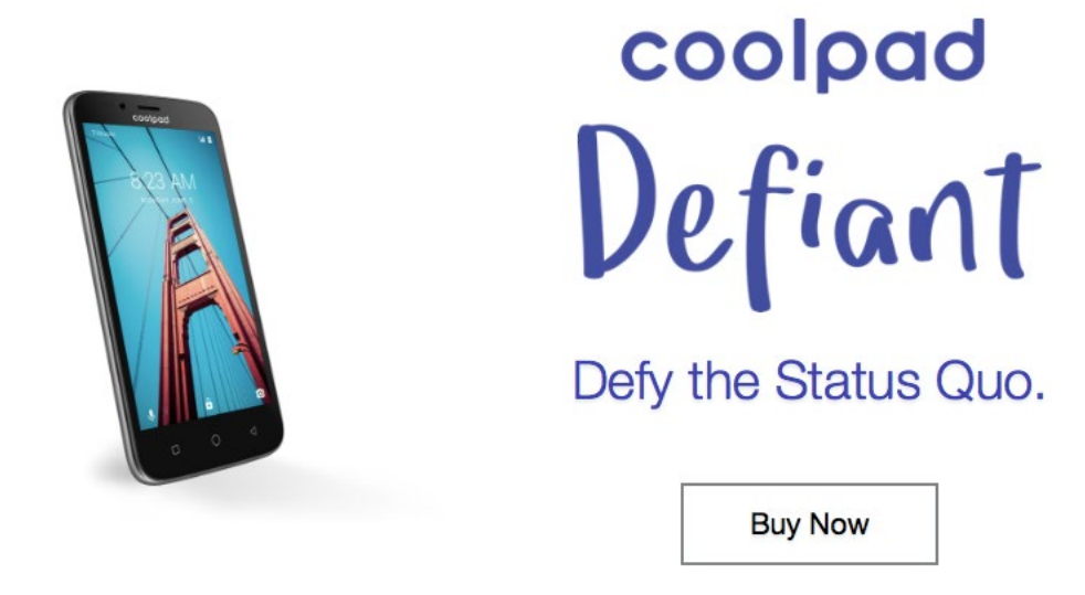
Figure 5. T-Mobile's Defiant is an electronic wireless hand held multimedia device.

25. T-Mobile provides a device with at least one of a wireless unit and a tuner unit supporting bi-directional data communications of data including video and text for the electronic wireless hand held multimedia device with remote data resources over cellular telecommunications networks, over wireless local area networks and over a direct wireless connection with electronic devices located within short range using Bluetooth communications after accepting a passcode from a user of the multimedia device during the communications. For example, T-Mobile's Defiant has Bluetooth capabilities allowing for communication over cellular telecommunications networks over wireless local area networks and over a direct wireless connection with electronic devices. See Figure 6;