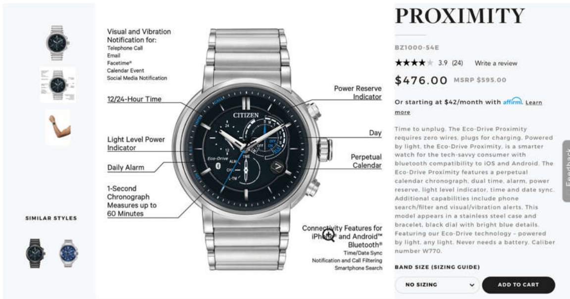
Figure 1. Citizen’s Proximity provides notifications for social media, email and events.

17. Direct Infringement. Citizen has been and continues to directly infringe at least claim 7 of the '095 Patent in this District and elsewhere in the United States, by providing an app that satisfies the preamble of claim 7” “[a] wireless communications system.” For example, Citizen’s Proximity provides notifications for social media, email and events. Upon information and belief, Citizen has performed each step of claim 7 at least by internal testing of Citizen’s app. See https://www.citizenwatch.com/us/en/mens-proximity/BZ1000-54E.html ; webpage attached hereto as Exhibit C; Figure 1.