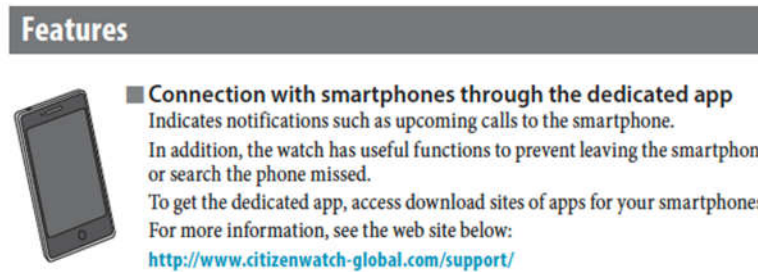
Figure 2. Citizen’s Proximity connects to smartphones and identifies upcoming calls.

http://embed.widencdn.net/download/citizenwatch/wxldoq2nw7/Proximity_Setting_Guide.pdf?u=41zuoe ; webpage attached hereto as Exhibit D; Figures 2, 3.