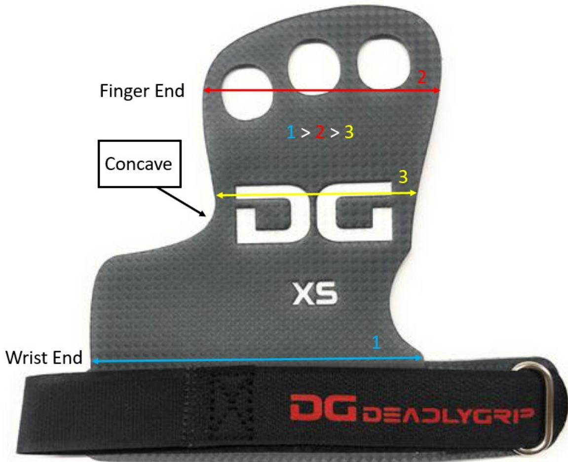
The Infringing Product – Original Design

the Infringing Products also has one side shorter than the other, and this shorter side has a concave shape relative to the other side.