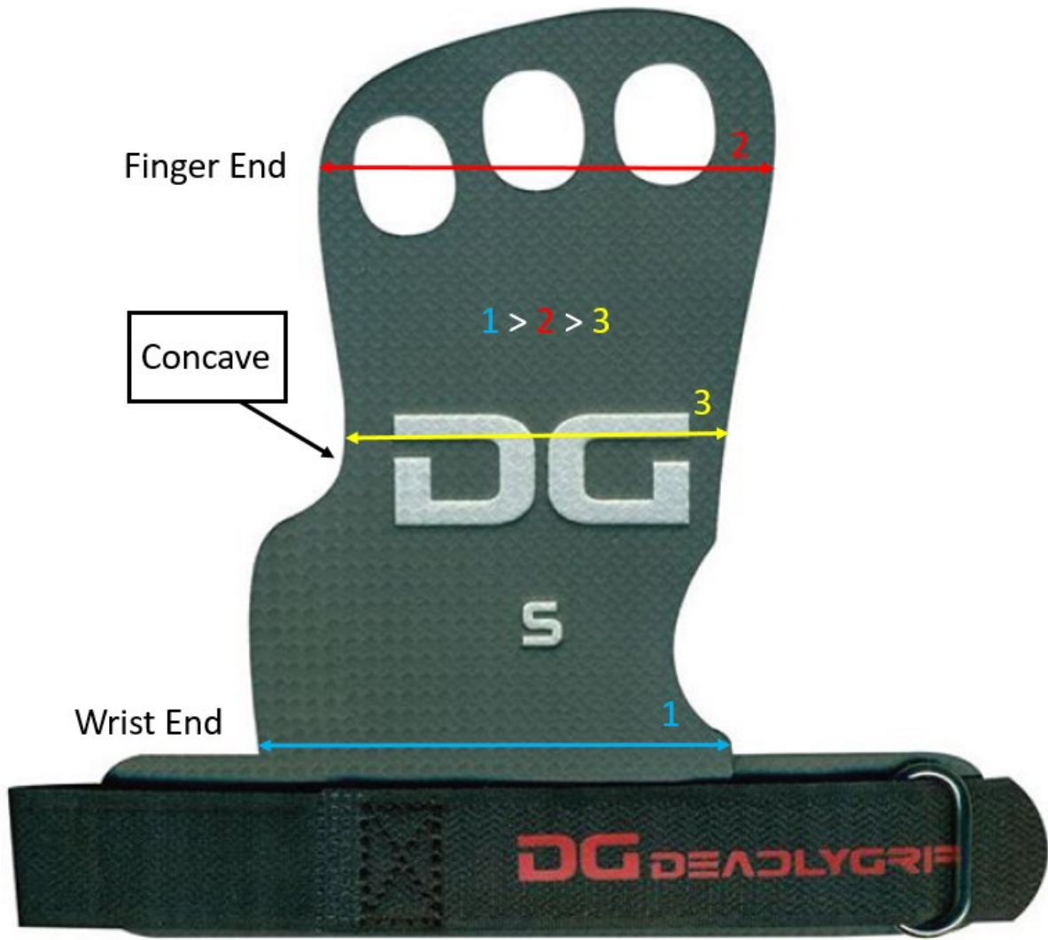
The Infringing Product – “Improved” Design