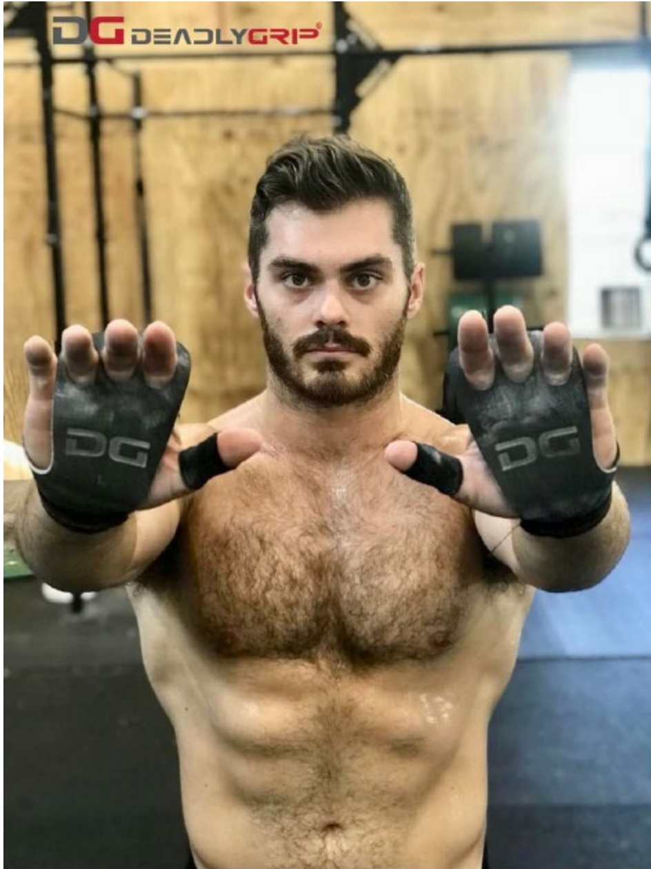
The Infringing Product as Worn (Showing Ulnar Portion of Palm Exposed)

34. On information and belief, Bulicich takes active steps to induce infringement by others of one or more of at least claims 1-8 of the '073 Patent in violation of 35 U.S.C. § 271(b), including customers that purchase the Infringing Products. Such active steps include but are not limited to encouraging, advertising (including through deadlygrip.com and Instagram), promoting, and instructing others to use and/or how to use the Infringing Products. For example, the