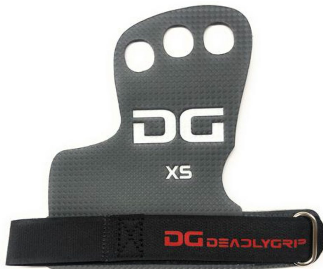
Image of Infringing Product taken from deadlygrip.com