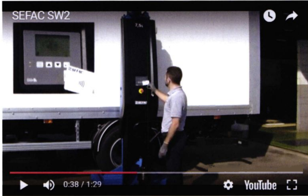
SefacUSA's website posting

15. Upon information and belief, the wireless portable vehicle lift systems comprising the SW2 wireless column lifts infringe at least independent claim 1 of the '403 Patent and methods of operating the wireless portable vehicle lift systems infringe at least independent claims 14, 19 and 22 of the '403 Patent. To illustrate infringement of the '403 Patent, Plaintiff has attached hereto as Exhibit B a claim chart showing how the wireless portable vehicle lift systems comprising the SW2 wireless column lifts and their methods of operation satisfy each of the claimed limitations of independent claims 1, 14, 19 and 22 of the '403 Patent. The claim chart of Exhibit B is incorporated herein by reference in its entirety.