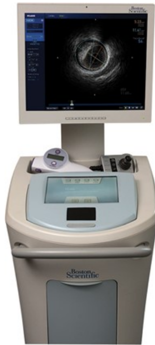
Figure 1: POLARIS Cart Configuration

30. Defendant provides this sample image of the POLARIS interface on a YouTube video