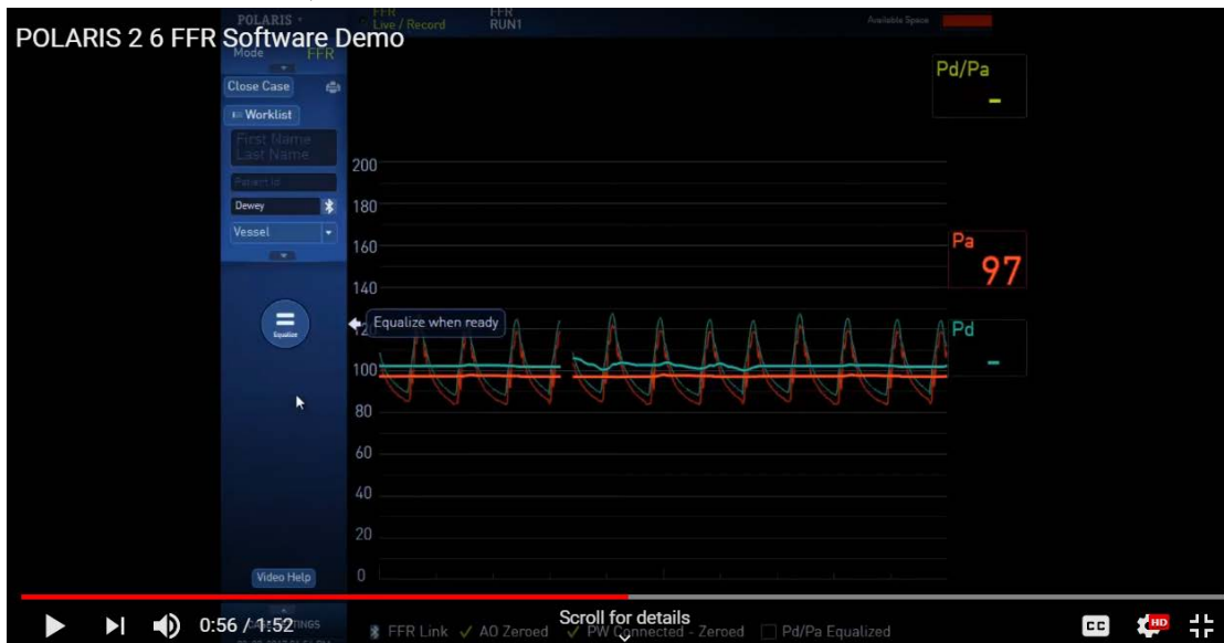
Figure 2: POLARIS Sample Interface

https://www.youtube.com/watch?v=H_CxGAnaWi0&feature=emb_title (last accessed Oct. 30, 2020):