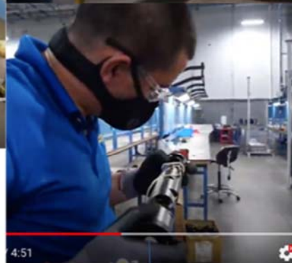
Transfer side plunging (pin) contact