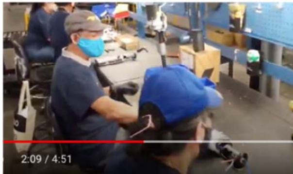
Detonator side plunging (pin) contact