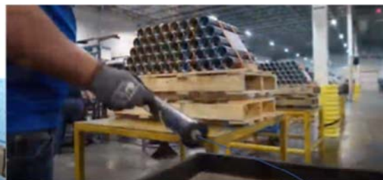
Transfer side plunging (pin) contact