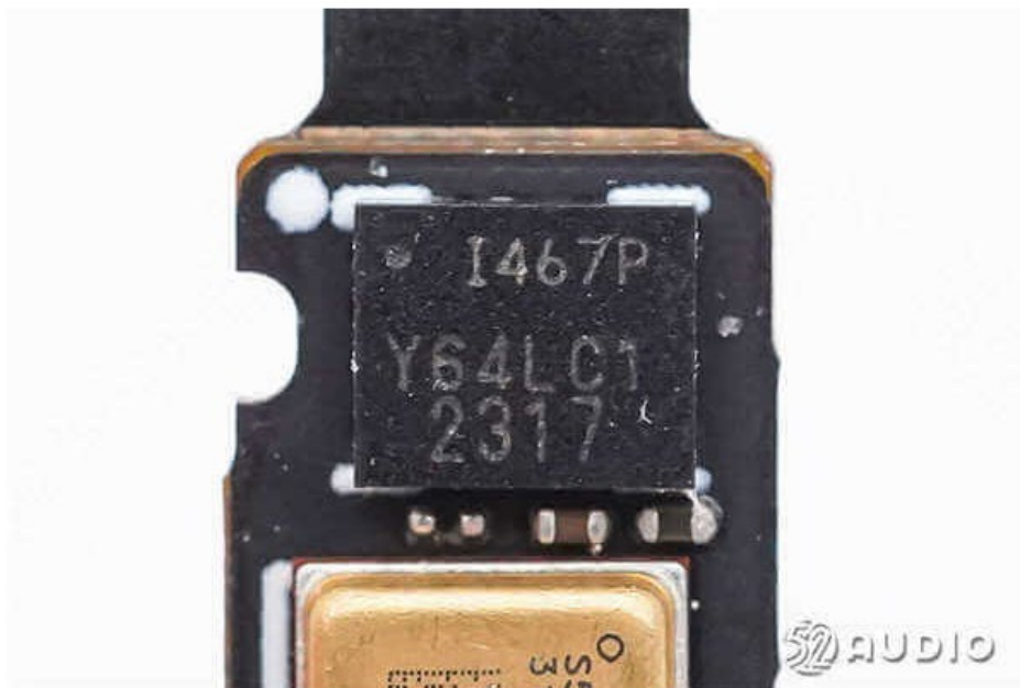
Silk screen I467P 6-axis gyroscope, model: ICM-42670-P, from TDK, used for spatial audio function to collect user head movement data.