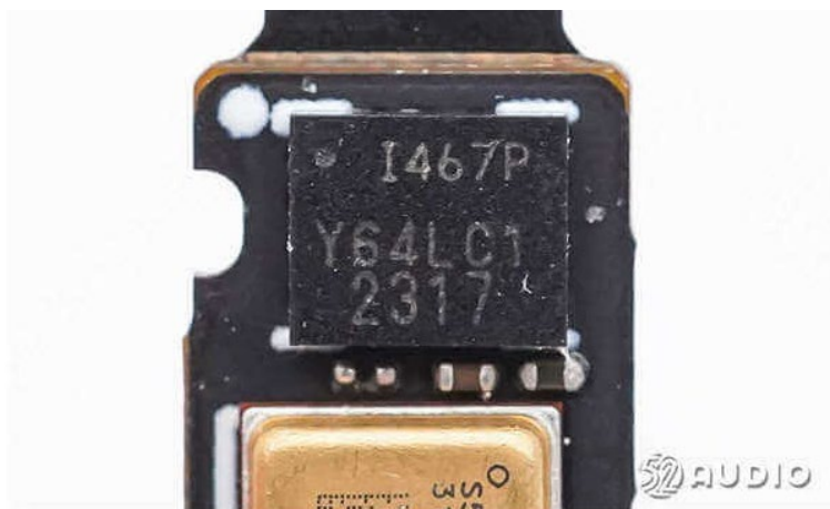
Silk screen I467P 6-axis gyroscope, model: ICM-42670-P, from TDK, used for spatial audio function to collect user head movement data.