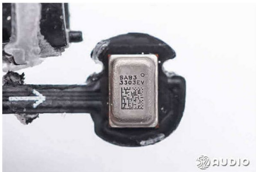
The MEMS microphone of Laser Engraving SAB3 is a call microphone, which is used to pick up human voices during the call function.