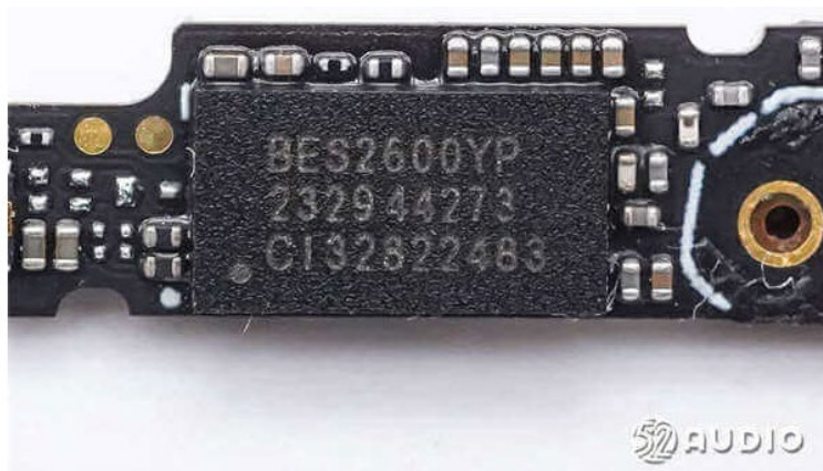
BES BES2600YP bluetooth audio SoC, bluetooth + noise cancellation + in-ear detection 3-in-1 single chip solution. Supports dual-mode Bluetooth 5.3 and multipoint connections. Internally integrated dual-core ARM STAR-MC1 CPU and ultra-low power Sensor Hub subsystem have powerful application processing capabilities. Supports open adaptive noise cancellation and AI noise cancellation. Supports assistive listening function and spatial audio. Support voice wake-up and interactive functions.