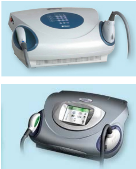
A.1. Palomar Trade Dress Console